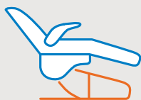
Cleanings and Exams