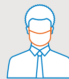
Endodontics and Periodontics